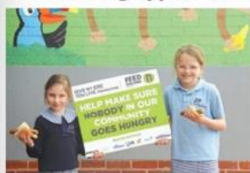
St Margaret's Primary School in East Geelong held a sausage sizzle on Friday (October 14) and raised $500 for the Appeal.