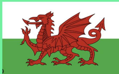
Flag of Wales