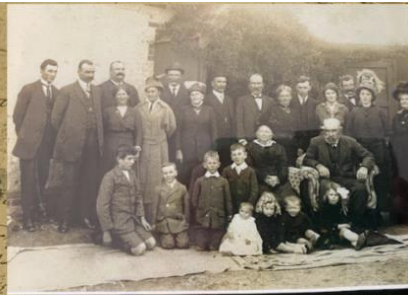
Standing Left to Right