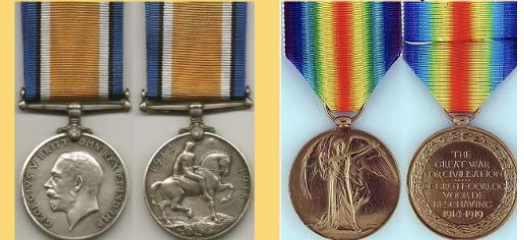
The British War Medal The Victory Medal