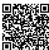
Parent and Carer