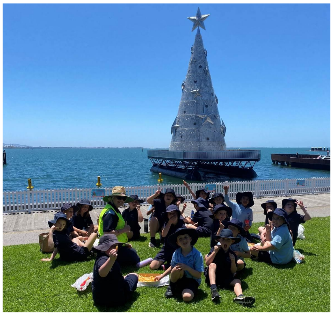
Year 1/2 Eastern Beach Excursion