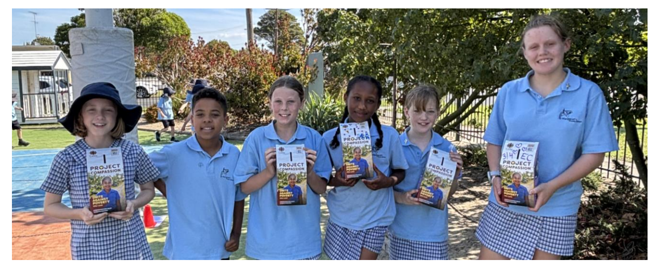
Thanks to our Religious Education Leaders for their work promoting Project Compassion. Congratulations to 3/4 EC for their winning efforts in the 'Coins for Caritas' event.

School Board 7pm Year 6 Graduation End of Term Four 1.30pm dismissal