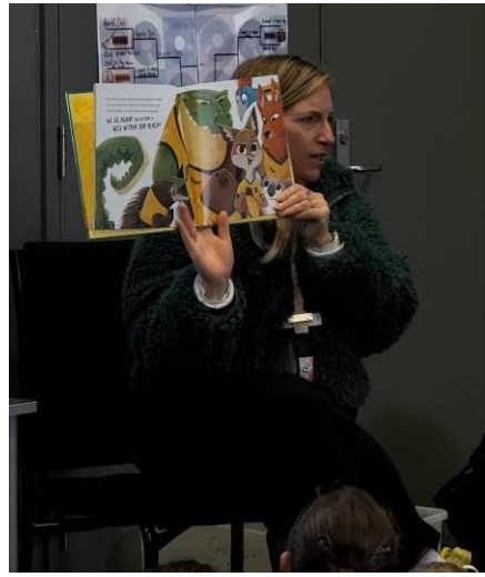
Preps - 2s participated in the 2026 National Simultaneous Storytime, listening to the story "Luna Roo"